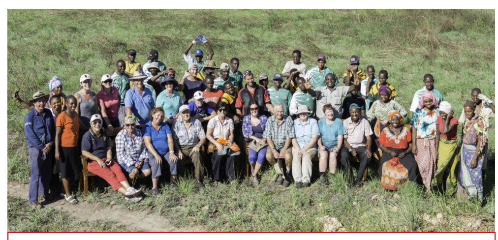
TEAM C with some of our local employees. Two countries working together for our cause.