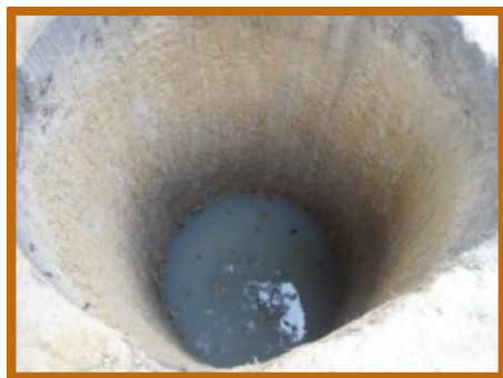
30 feet and we've got water!