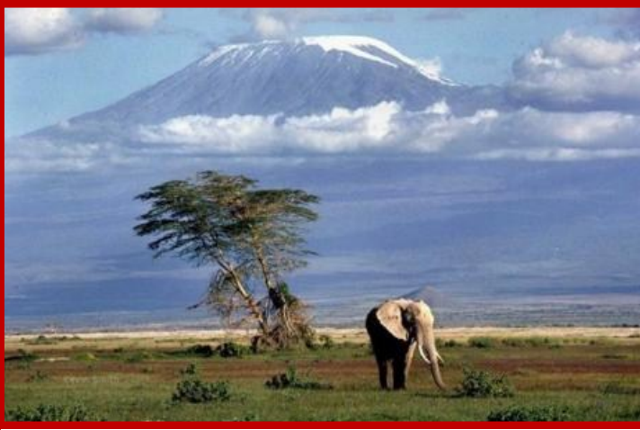
Looking at Mt Kiliminjaro from Amboseli National Park, Kenya