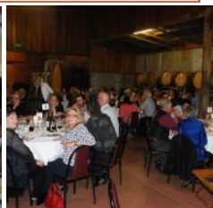
Shepparton Central Rotary Club, VIC.

We had 45 parties register for the event from across Australia and overseas with a total of 683 guests. The largest party with over 100 guests was held in Victoria. It was also great to see a dinner party held in Mombasa, Kenya, which raised $320 for the project.