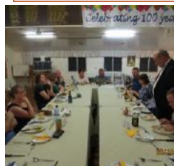
Rockhampton South Rotary Club, QLD.