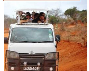
So many picture perfect moments on safari