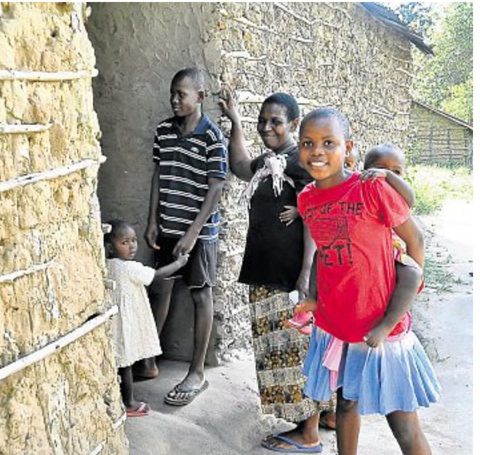
HAPPY TIMES: Villagers enjoy a laugh.

To donate or to find out more about the project, visit http://umojahome.com.