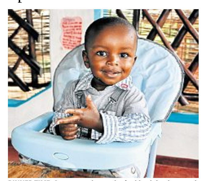
DINNER TIME: A young orphan waits for his night-time meal.

Profits from the hire of the vehicle will go towards the establishment of the Umoja Orphanage and then help with ongoing operation costs.